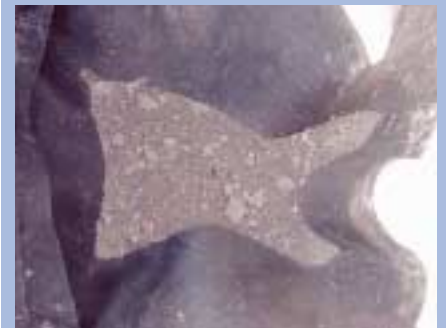
Filtered stormwater debris