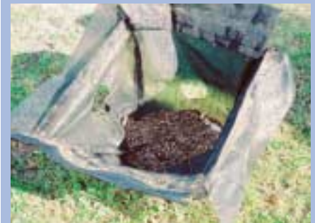
Remove, clean, reuse