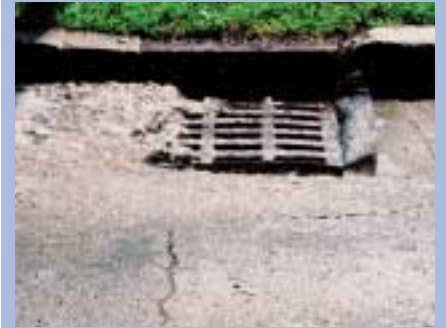
Rain event performance test